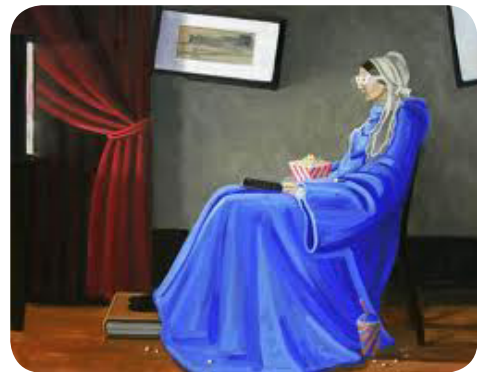
Whistler's Mother Got a Snuggly Inspired by Whistler's "Arrangement in Grey and Black"